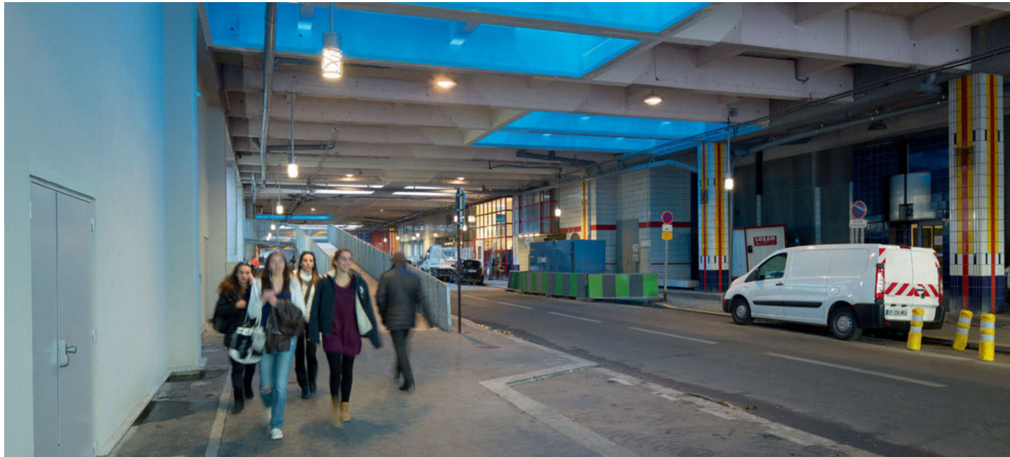
LEC Lyon worked closely with Concepto on the Rue Robert de Flers, providing the Ligny-5635 for use in the project. The lightbars were created with a bespoke colour profile installed, customised in green, blue and warm white. Schreder also provided pedestrian suspended luminaires for use in the tunnel space.

deal with the different demands the project placed on the lighting, due to their ability to allow the emission of multiple colours from a relatively small fixture.